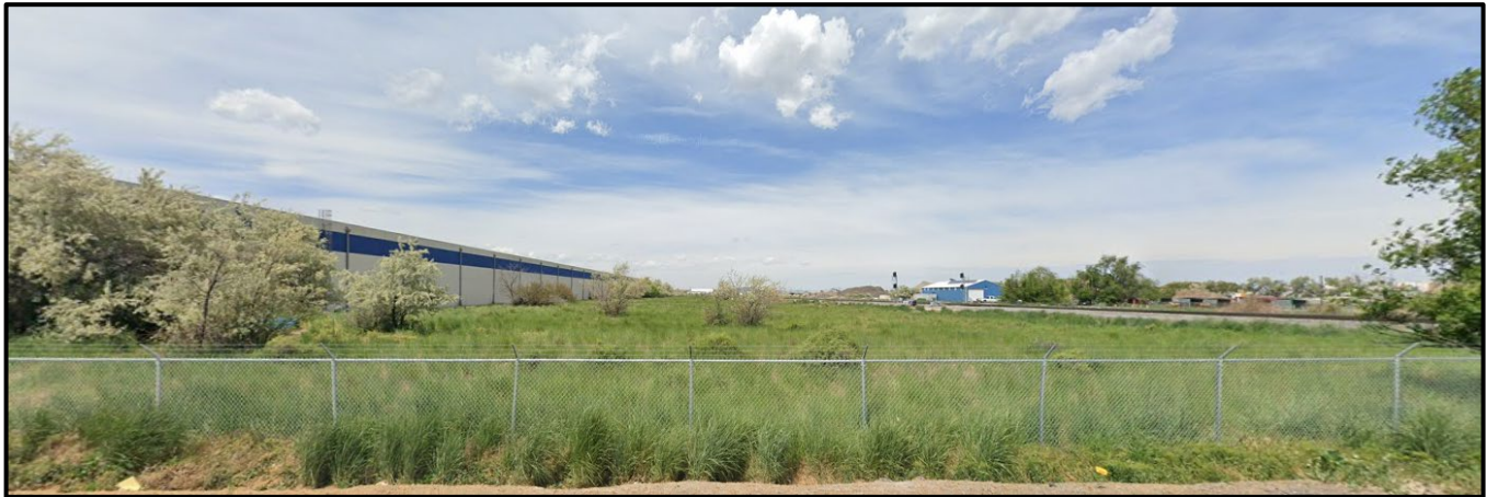
Subject Property from Gladiola Street

Petition Number: PLNPCM2023-00236 Application Type: Zoning Map Amendment Project Location: 680 South Gladiola Street Current Zoning District: M-2 Heavy Manufacturing District Proposed Zoning District: M-1 Light Manufacturing District Overlay District: Airport Flight Path Protection Overlay, Zone B Council District: District 2, Alejandro Puy